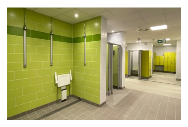
2 - The 'New Look' changing rooms at Penarth Leisure Centre