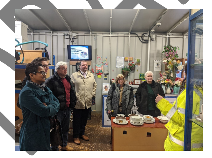
3 - Members of the Environment and Regeneration Scrutiny Committee and the Operational Manager for Neighbourhood Services at the Tip Treasure re-use and recycle shop in Swansea.

In February 2020, following a recommendation made by the Committee, Members and Officers attended a site visit to Swansea's 'Tip Treasure' re-use and recycle shop with a view to hopefully setting up a similar social enterprise in the Vale. Following the site visit, at the October 2020 Committee meeting, Officers advised that the Vale of Glamorgan had been successful in applying for a £358k bid from Welsh Government to set up a re-use shop on the Atlantic Trading Estate, a great result that will provide numerous community benefits to residents of the Vale of Glamorgan!