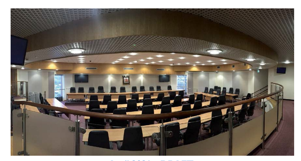
April 2021 – DRAFT