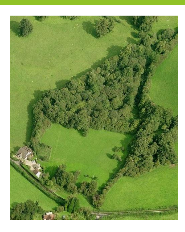
Progress - awaiting start