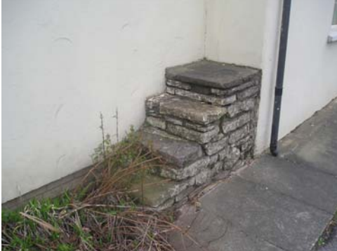
Mounting Block outside Trehill.