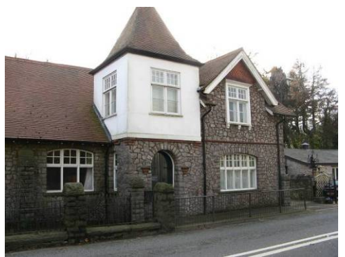
St. Nicholas Church Hall House.