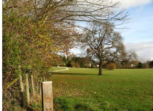
The landscape setting of the Conservation Area.