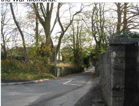
Trees and walls play an important part in creating enclosure, particularly in the lanes.