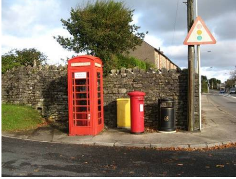
The Post Box and Telephone Call Box.