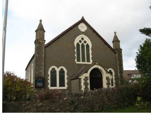
Trehill Presbyterian Chapel.