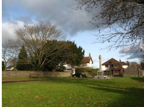
View across War Memorial green