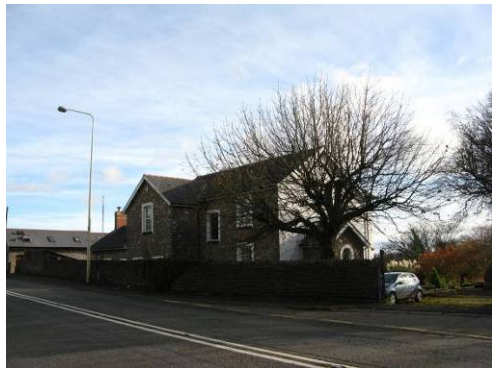
Broadway House, an unlisted but 'positive' building.