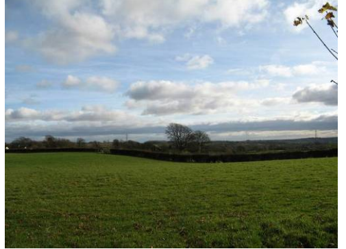
View southwards from Duffryn Lane.