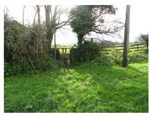
View southwards from the western end of the conservation area.