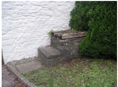
Mounting Block outside Pwllsarn.