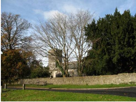
St. Nicholas' Church glimpsed through the surrounding trees.