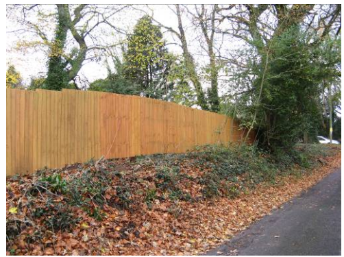
Inappropriate boundary treatments can have a negative effect on the Conservation Area.