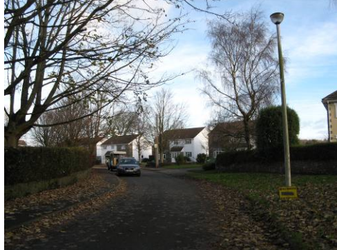
Modern housing that does not add to the special architectural or historic interest of the area.