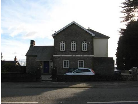
The Former Police Station.