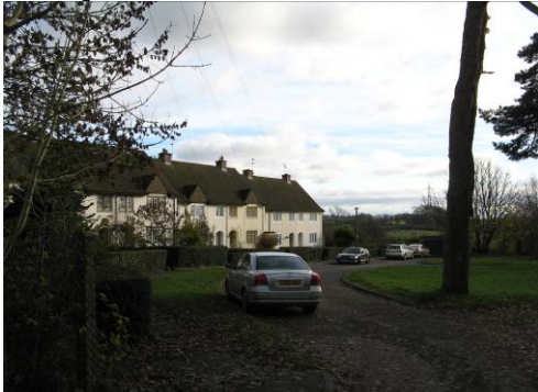
Modern housing makes up a significant proportion of the village.