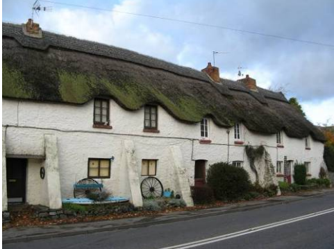
Nos. 3, 4 and 5 Smith Row.