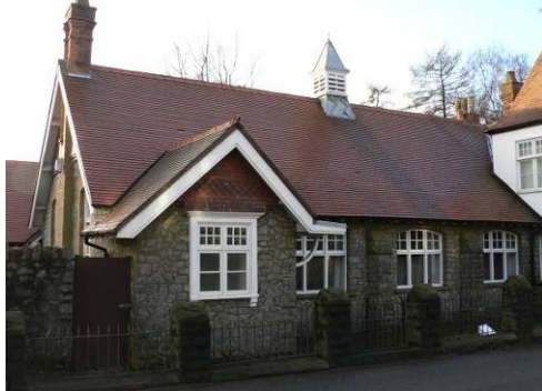
St. Nicholas Church Hall.