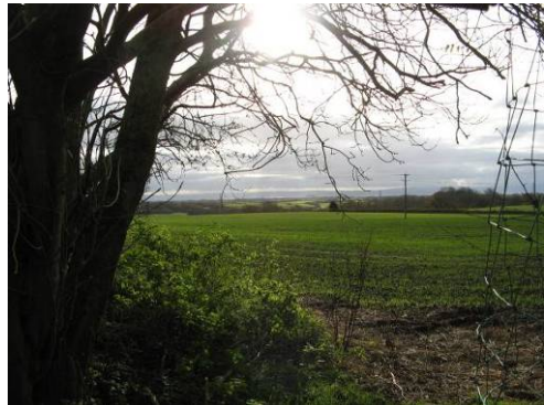
Views to the south.