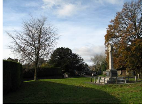
An informal green provides the backdrop to the War Memorial.