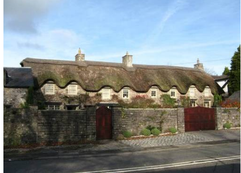
The Three Tuns.