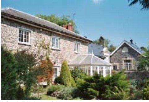
The Old School House.