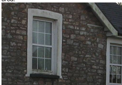
Inappropriate detailing such as the use of uPVC windows can detract from the quality of a building.