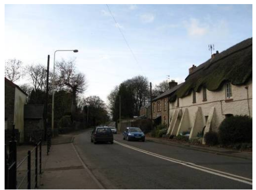
The A48 is the defining spatial feature of the village.